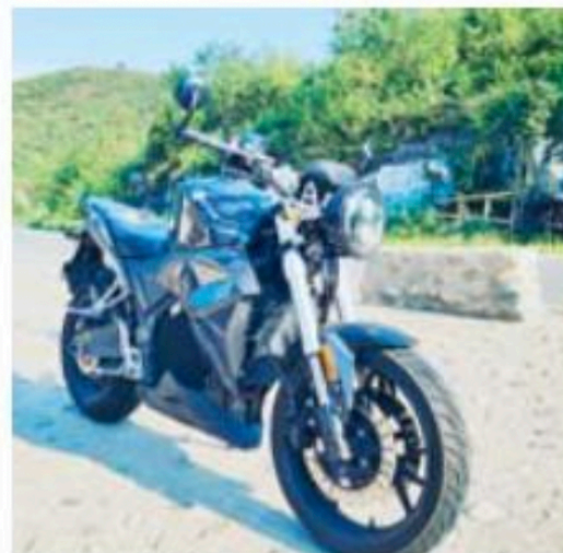
The powerful Evoke.

The Expo will be held on Sunday 21 March, from 10-2pm, at the Noosa Transit Centre Car Park, Lanyana Way, Noosa Junction. Further information at noosaeexpo.com.au .