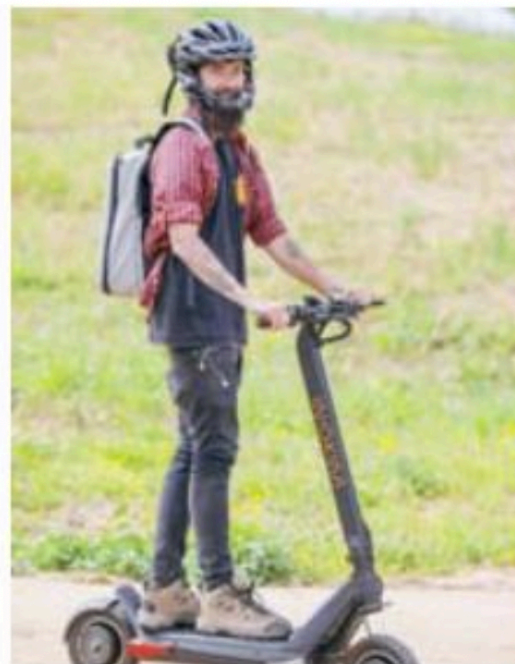
Inokim electric scooter.