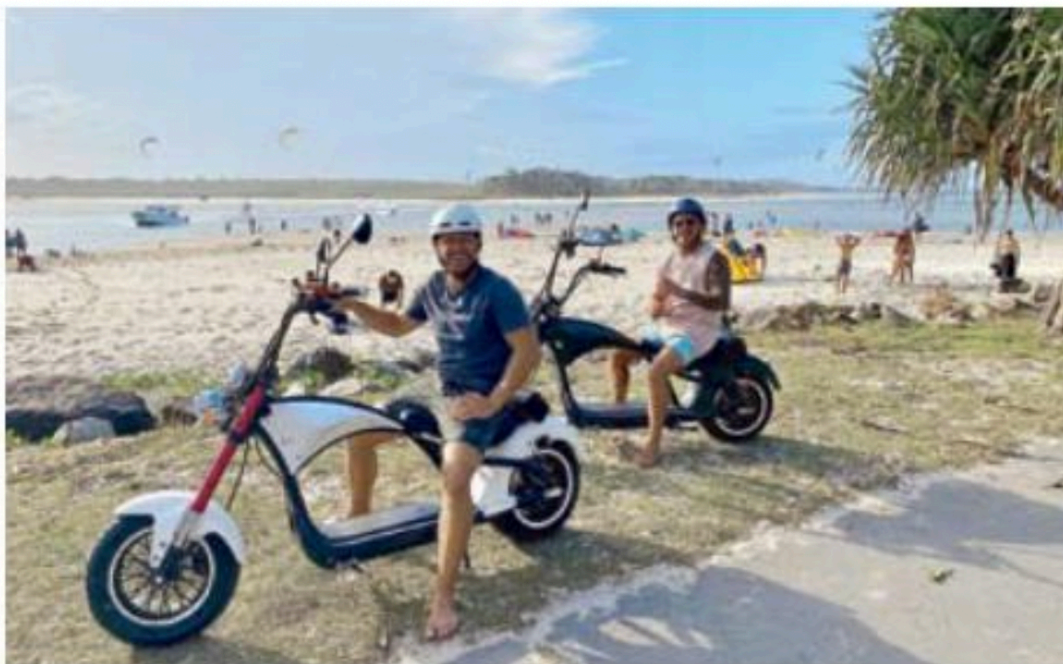
Wyld e-choppers in Noosa.